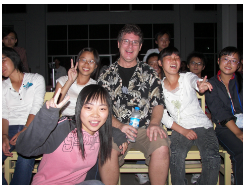
Figure 1: Me surrounded by some of my students in Fuling, China.

Now I will insert an eps figure. Note where it puts the photo. You may want to try some trickery to get it to put the photo in another place. Even though the file is Emperor_Jeff.eps , note that the package "epstopdf" that automatically creates a pdf file, and uses it instead.